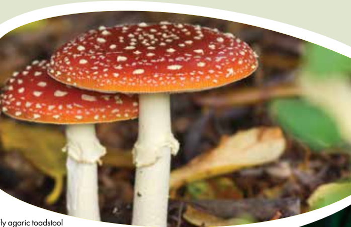
Fly agaric toadstool