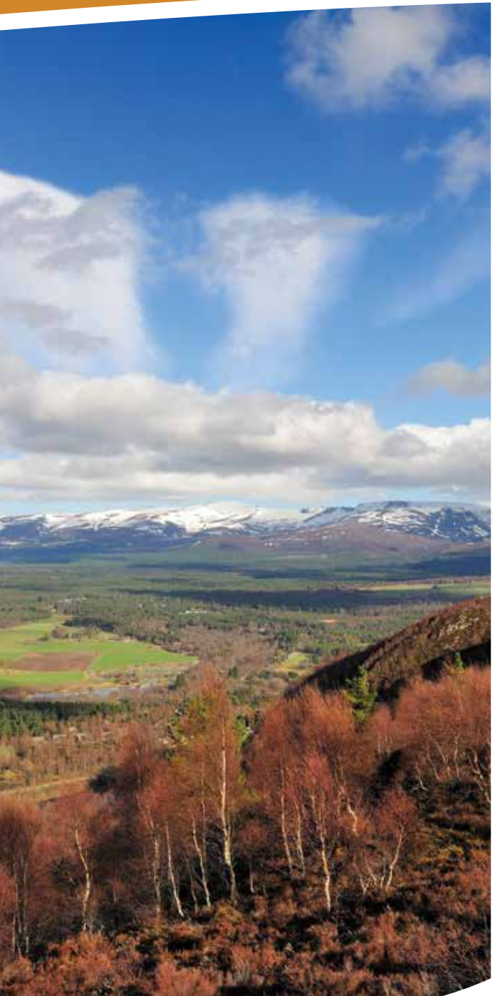
View from Craigellachie towards Cairngorms

Main map by Ashworth Maps. All map data © Crown copyright 2011. Ordnance Survey. Licence number 100017908 © Scottish Natural Heritage 2015. ISBN 978-1-85397455-9. Print Code: WIG200615