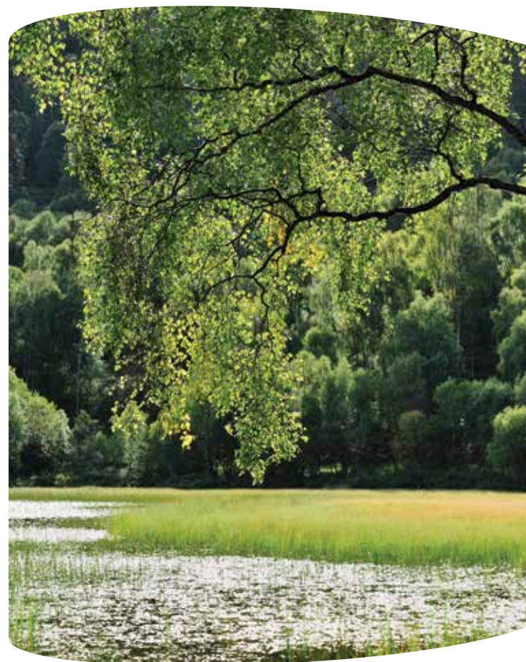
View across old reservoir

Also look out for a sign giving details about an audio guide to the Reserve that you can access via your mobile phone.